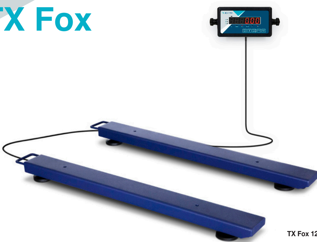
TX Fox 120