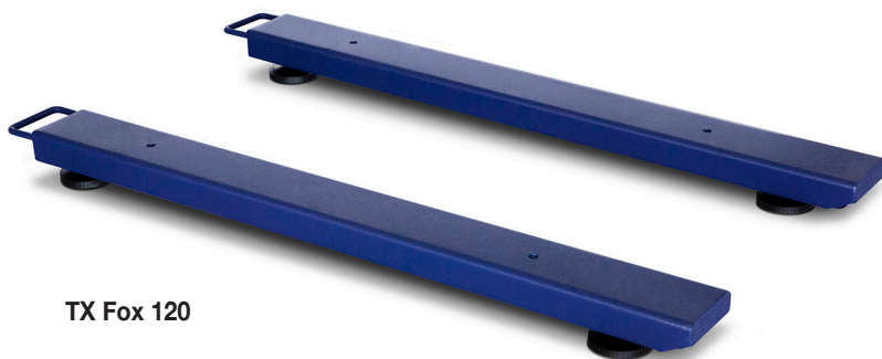
TX Fox 120

Serial calibration. The device is supplied, calibrated and adjusted by our Barcelona calibration laboratory.