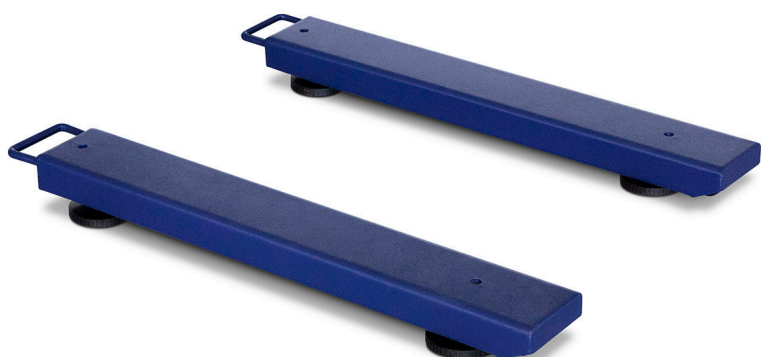
TX Fox 80

The TX electronic indicator , highly reliable, includes a 4-meter long cable and can be positioned remotely from the platform, on a table, or on the wall, with its included stand. The weighing response is extremely fast, showing stable weight accurately in less than 2 seconds.